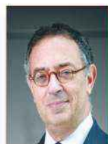
Sir Bernard Eder International Judge, Singapore International Commercial Court; Arbitrator/Mediator, Essex Court Chambers

Bernard Eder practised as a barrister at 4 Essex Court/Essex Court Chambers, London for almost 35 years between 1976-2010 specialising in commercial litigation and international arbitration covering a wide