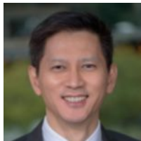
Chan Leng Sun SC Advocate, Essex Court Chambers Duxton (Singapore Group Practice)

SIArb Commercial Arbitration Symposium 2019